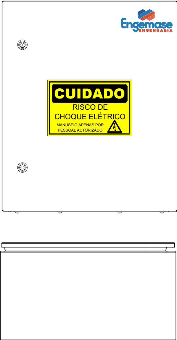
VISTA FRONTAL EXTERNA